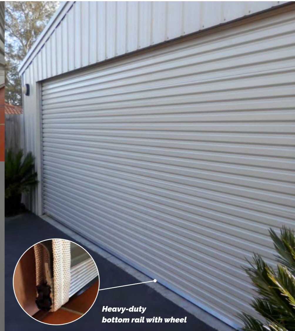
Heavy-duty bottom rail with wheel